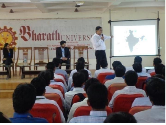
Pre – Placement Talk