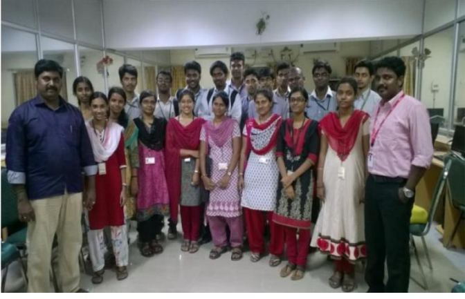
Announcing the results