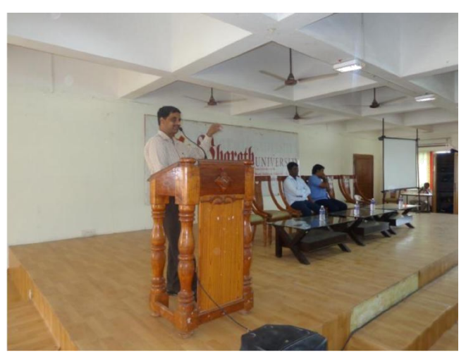
Pre – Placement Talk