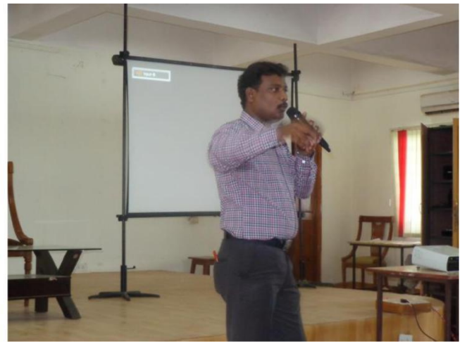
Pre – Placement Talk